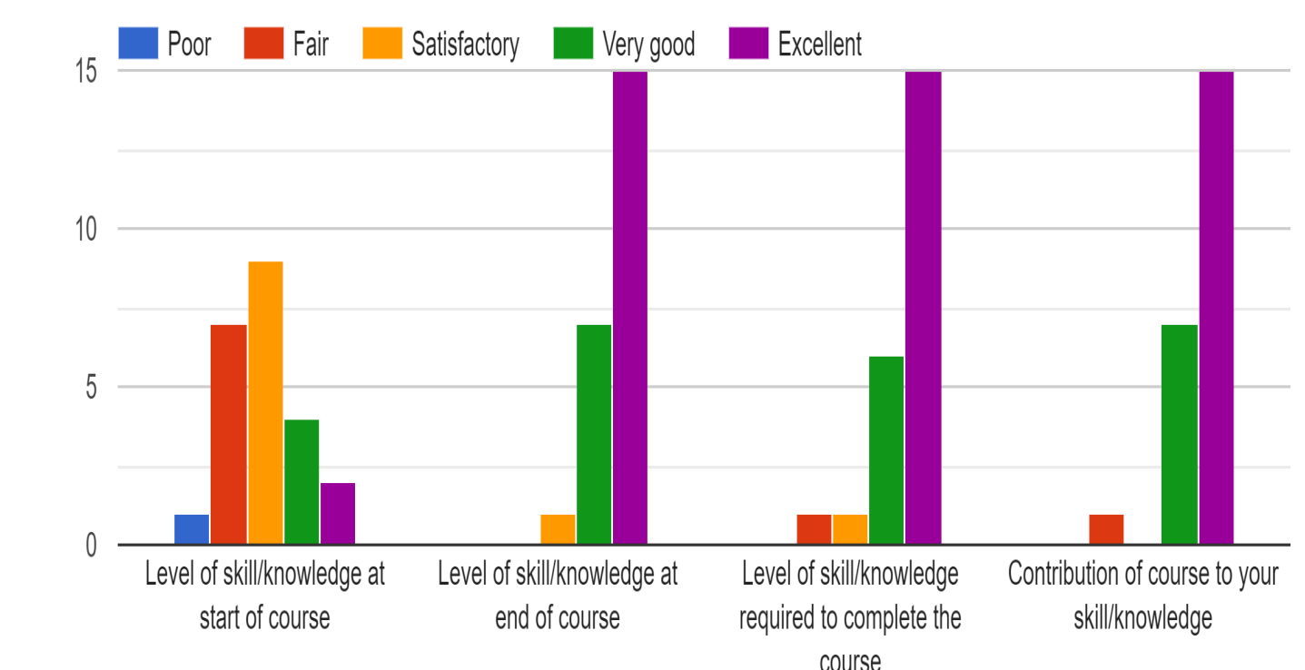
Contribution to learning

The participants' overall reaction was quite positive. We are confident in executing this intervention this year, with some improvements and recorded feedback.